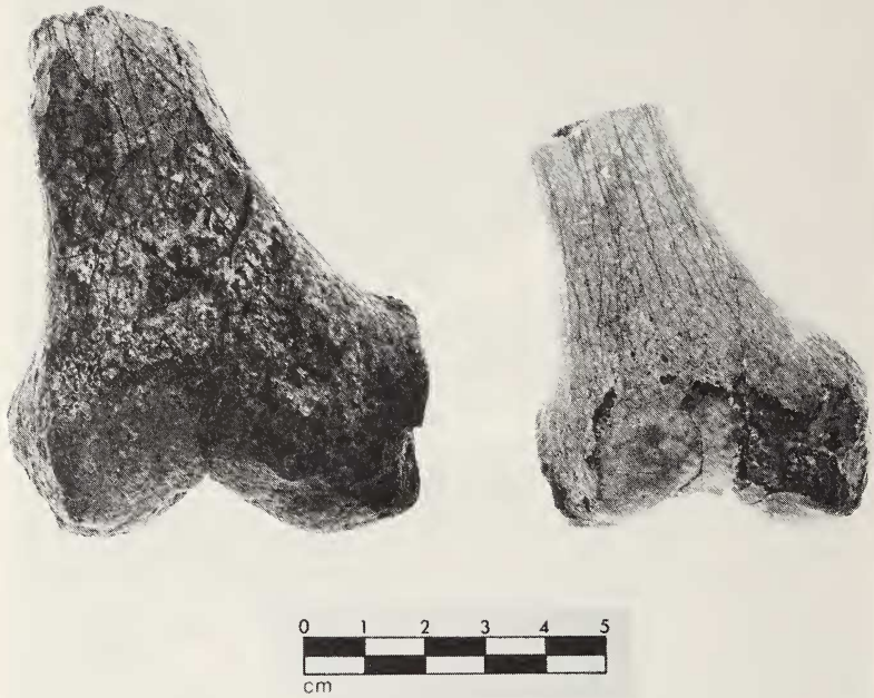
Fig. 3. Two distal femora from Hadar, Ethiopia (A.L. 333-4, left; A.L. 129-1a, right) indicating the size variation within the new species. Anterior view.